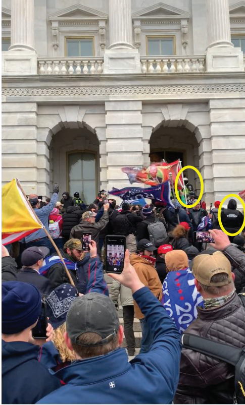
Still Image #6