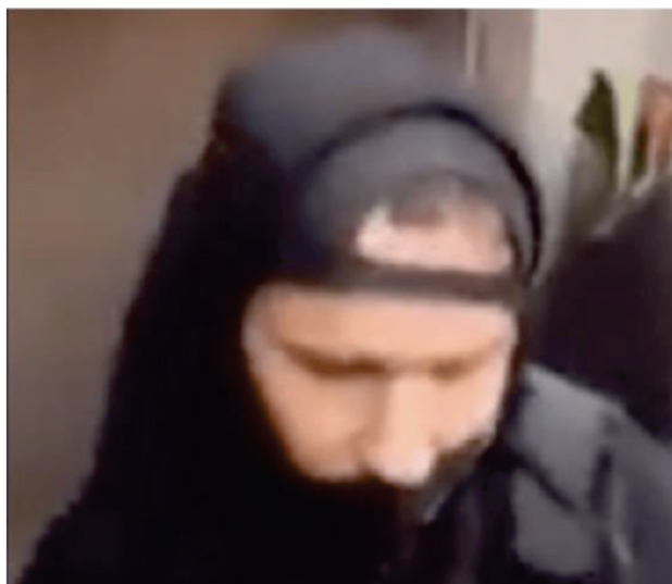
Still Image #2