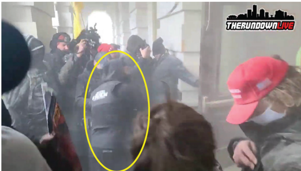
Still Image # 3

At various times, including approximately 15 seconds before the time of the below still image, officers cracked open the doors and deployed chemical irritants at the crowd and then closed the doors again.