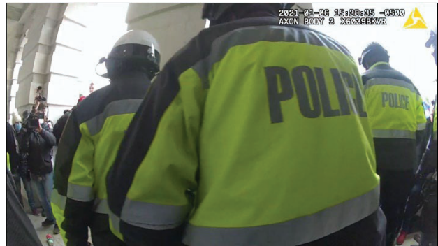
Still Image #7

Officers maintained their position behind the North Doors during the timeframe when ST PIERRE and other rioters threw objects at the door as depicted below in Still Image #8. The doors leading to the exterior of the North side of the building are out of frame just below the surveillance clip in Still Image #8.