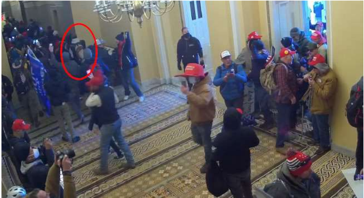
NEALY is then observed on CCTV inside of and walking around the Crypt East.