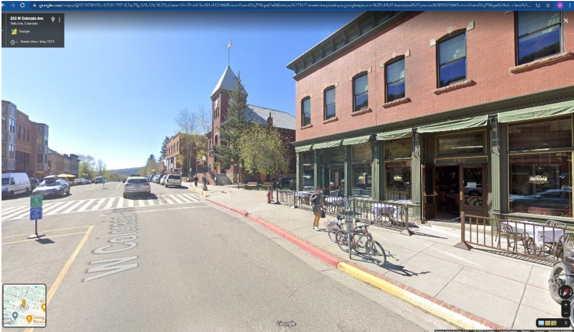
Photo 3 - Google maps - street view of Colorado Avenue in downtown Telluride, CO