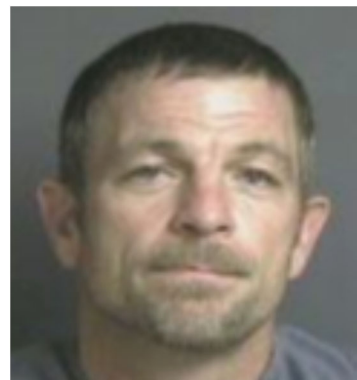
Image 5, 2017 Booking Photo