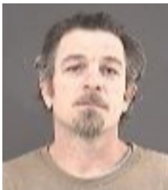
Image 4, 2020 Booking Photo