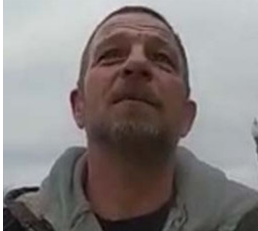
Image 17- cropped version of Image 3 – Screenshot of AFO-324 from D.C. Metropolitan Police Posting