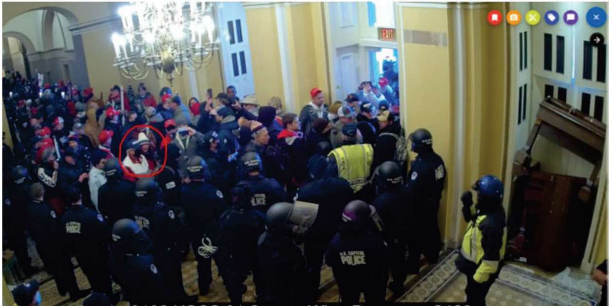
Image 6 (N.B. and BLACKWOOD walking out of the Senate Wing Door at 3:25 pm)

Approximately 30 minutes after they first entered, BLACKWOOD and N.B. walked back out through the Senate Wing Door at 3:25 pm: