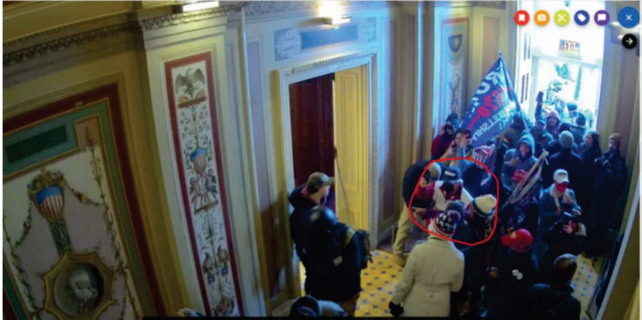
Image 2 (View from the front of N.B. and BLACKWOOD, holding a phone, entering the U.S. Capitol building at 2:55 pm)

BLACKWOOD and N.B., surrounded by police, walked out that same door at 3:02 pm: