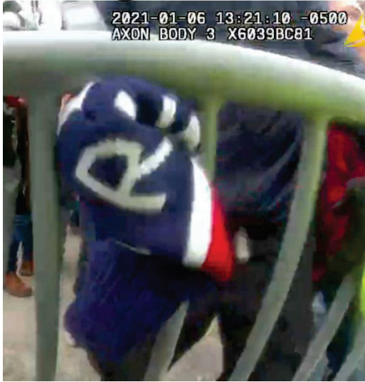
Exhibit 13: MARTIN grabbing the metal barricade.