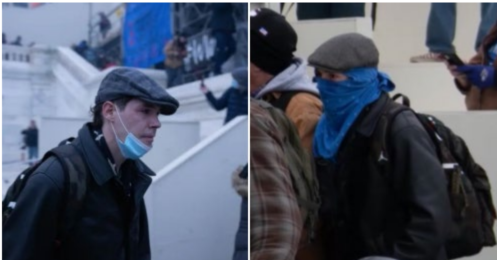
Figure 11: https://mobile.twitter.com/capitolhunters/status/1394002632797212673?lang=en