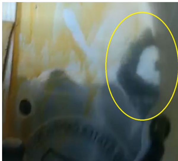
Figure 8: Officer-1 BWC