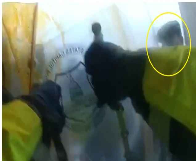
Figure 7: Officer-1 BWC

A review of BWC footage belonging to Officer-1 revealed that at approximately 4:46 p.m., DESJARDINS was observed assaulting Officer-1 using what appeared to be an object that resembles the size of a broken wooden table leg that is captured in the YouTube videos. Officer-1's BWC captured multiple strikes by DESJARDINS, including a strike at 4:47:25 p.m., shortly after another rioter threw a table at the officers. Officer-1's BWC footage corresponds with the YouTube videos mentioned above.