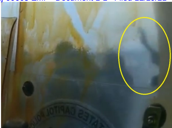
Figure 9: Officer-1 BWC

Near the time of the assault, Officer-1 was standing in close proximity to Officer-2. A review of Officer-2's BWC revealed DESJARDINS approaching the officers a second time with the broken table leg.