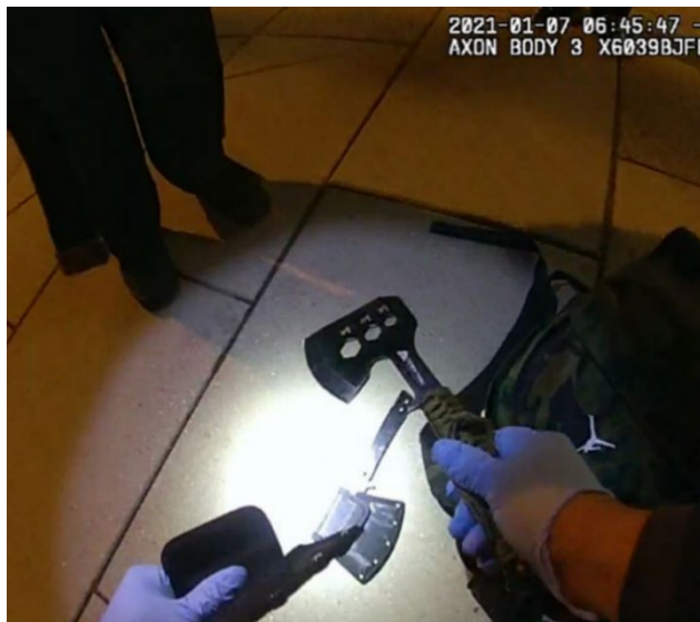
Figure 18: Officer-3 BWC