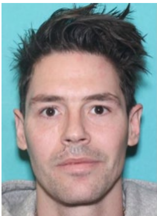
Figure 13: RI Drivers License Photograph