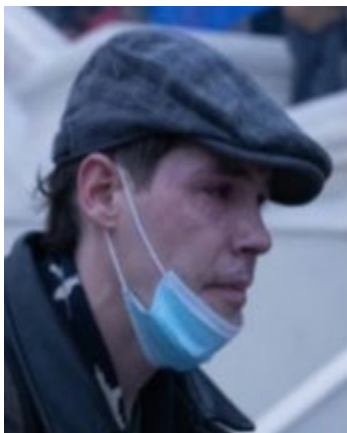
Figure 14: BOLO 348: https://www.fbi.gov/wanted/capitol-violence-images/348.png/view