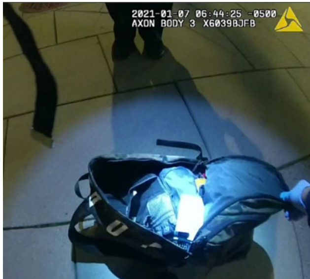
Figure 16: Officer-3 BWC