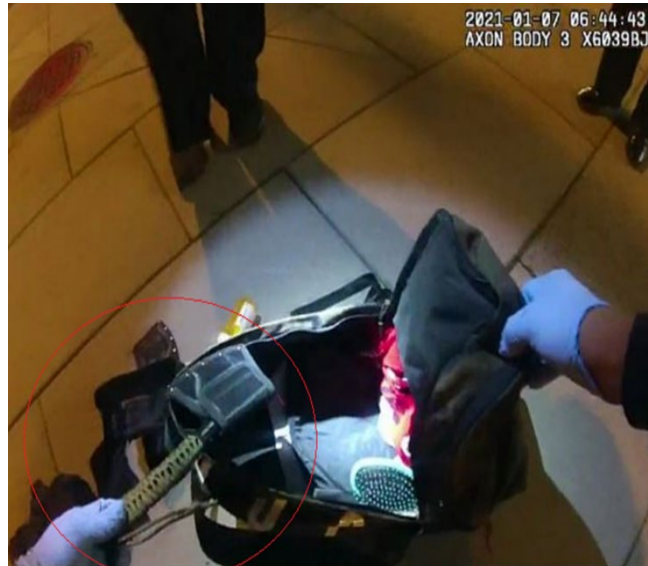
Figure 17: Officer-3 BWC