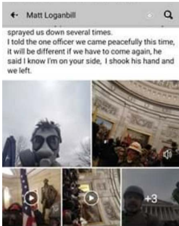
U.S. Capitol during the riot.