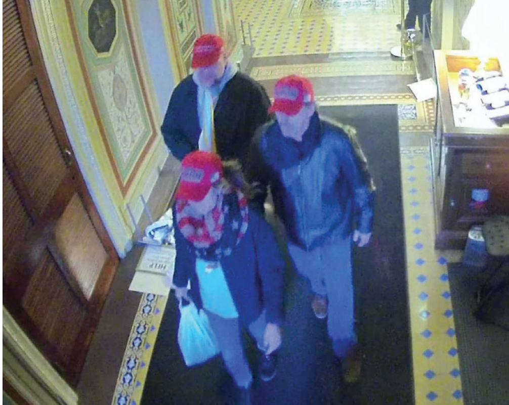
Exhibit 15 – Still image of U.S. Capitol CCTV