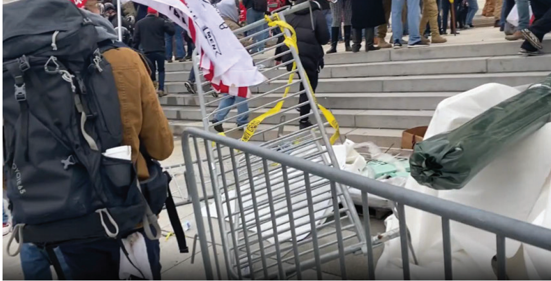
Exhibit 5 - Still frame of video, time stamp 0:21 located at https://archive.org/download/RXGNGvjfsGY3aan8e/goodlionfilms_IMG_5476_1_.mpeg4