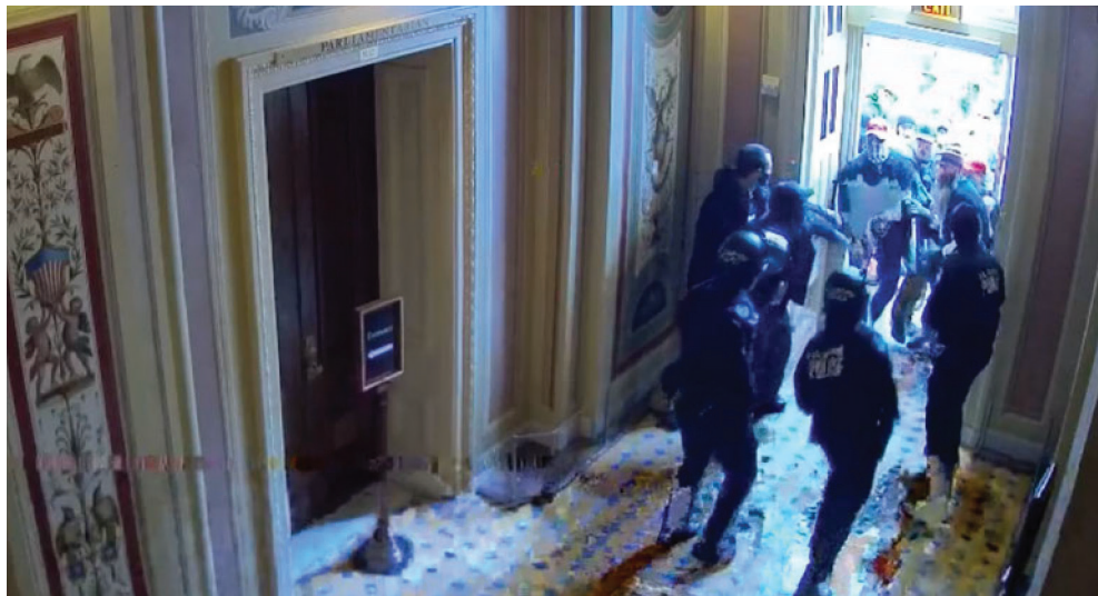
Exhibit 11 - Capitol Police CCTV screenshot