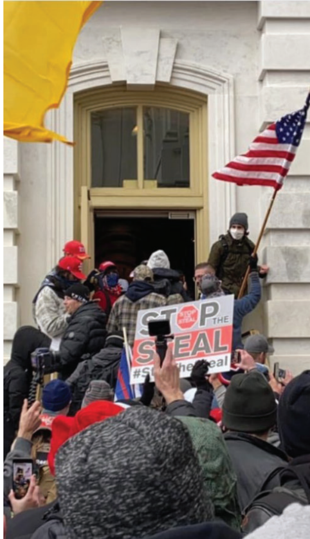
Exhibit 12 – Photograph saved on FONTAINE’s Facebook account

FONTAINE and DULA then moved forward and entered the U.S. Capitol through that door at approximately 2:55 p.m., only minutes after the initial violent breach at 2:42 p.m. Your affiant is aware of the time of their entry as I have located U.S. Capitol CCTV footage where FONTAINE and DULA are captured entering the U.S. Capitol. Exhibit 13.