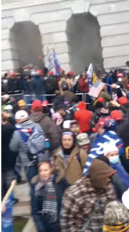
Exhibit 8 - https://www.youtube.com/watch?v=JNNY2zDuWOI&t=234s at 5:53

I reviewed a photograph in FONTAINE's Facebook records showing that during their time on the Upper Northwest Terrace FONTAINE also took a photograph of herself giving a thumbs up, with the area of the Senate Wing Doors and the Parliamentarian Door visible in the background. Exhibit 9.