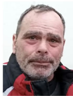
Photograph #145 - AFO A