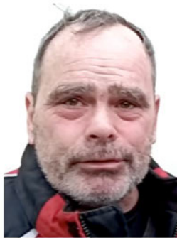
Photograph #145 - AFO B