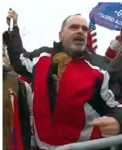
Photograph #145 - AFO C

Based on the BWC footage and open source video described above, the FBI created a profile for WEBSTER in its "Be On The Lookout" (BOLO) Assault on Federal Officer (AFO) list for the ongoing U.S. Capitol Riot investigations.