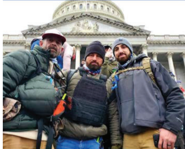
Patrick Montgomery Patrick Montgomery's Photos · 8 hours ago · View Full Size · More Options