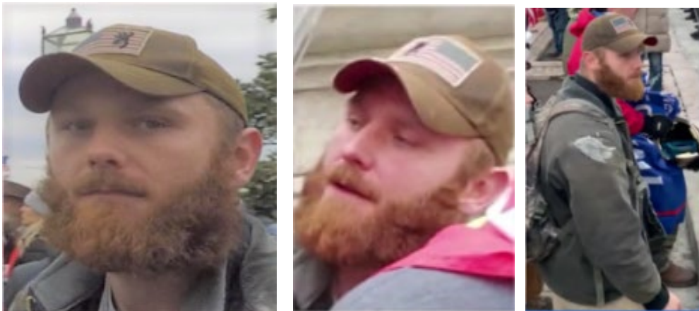
Images 1, 2, and 3 (left to right): Photographs Shown to Witness 1 and Witness 2

2. On October 21, 2021, the FBI Chicago Field Office interviewed an individual (“Witness 1”) who has a personal relationship with SHULER. Witness 1 visually identified SHULER using photos taken from the Capitol grounds. See Images 1–3 below. Witness 1 also provided information about SHULER’s Facebook account.