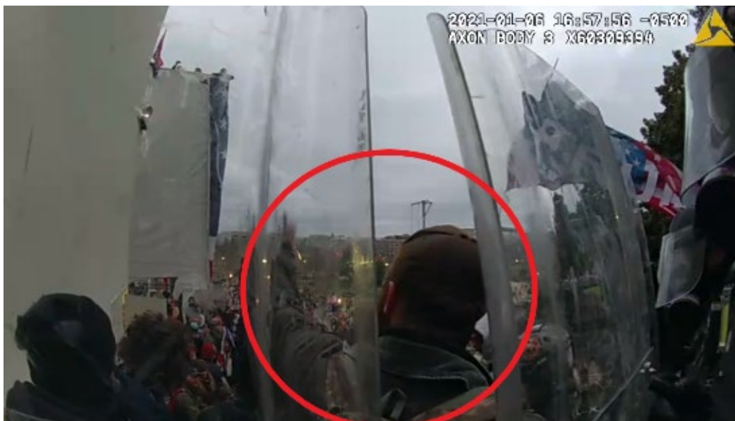
Image 13: Shuler (circled in red) as captured by Officer M.D.'s BWC

10. At approximately 4:57 p.m., as the police line approached the bottom steps, Officer M.D.'s BWC appears to show SHULER gesturing to others to meet him in front of the police line. See Image 13.