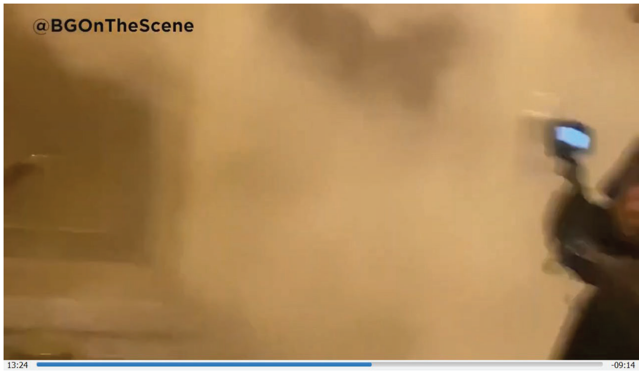
Image 4: The same hallway captured in Image 2 , now filled with tear gas, in the “BG On the Scene” video at time stamp 13:24.

Approximately twelve seconds after the scene captured in Image 2 , tear gas came billowing down the hallway, also captured in the “BG On the Scene” video.