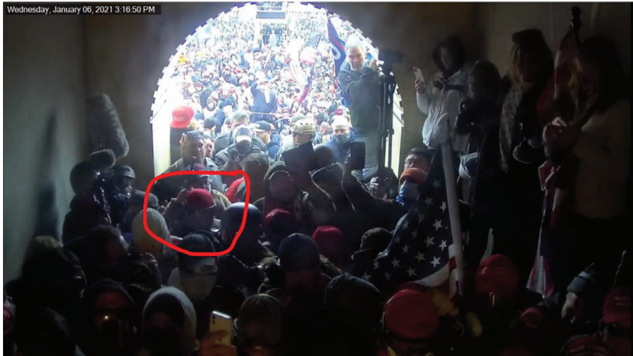
image from CCTV depicting AFO 235 pushing against other rioters as the crowd moved together against the police:

At approximately 3:19 p.m., the police successfully cleared the tunnel of rioters and pushed the rioters, including AFO 235, out of the tunnel and onto the LWT. AFO 235 remained at the police line for several seconds and clung to the edge of the tunnel entrance in an effort to resist the police push.