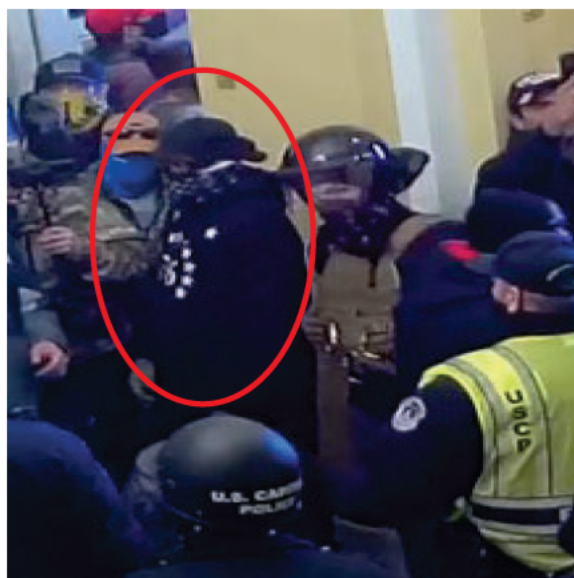
Figure 6: screenshot from USCP CCTV surveillance camera

As seen in the above screen shots from CCTV footage, an individual I believe to be Pelham based on his appearance, clothing, and the times and locations he was observed, was seen inside