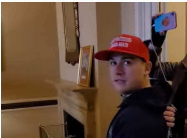
An unidentified man wears a hoodie featuring a Camp Pendleton Marine unit and a hat that says "Make Politicians Afraid Again" inside the U.S. Capitol Jan. 6.

Man wearing Camp Pendleton Marine unit hoodie roamed Capitol building during insurrection, videos show