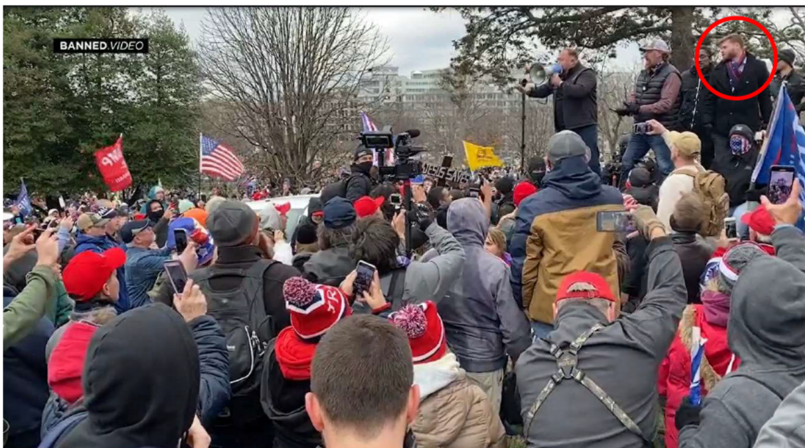
VIDEO: Alex Jones Tried To Stop Storming of DC Capitol