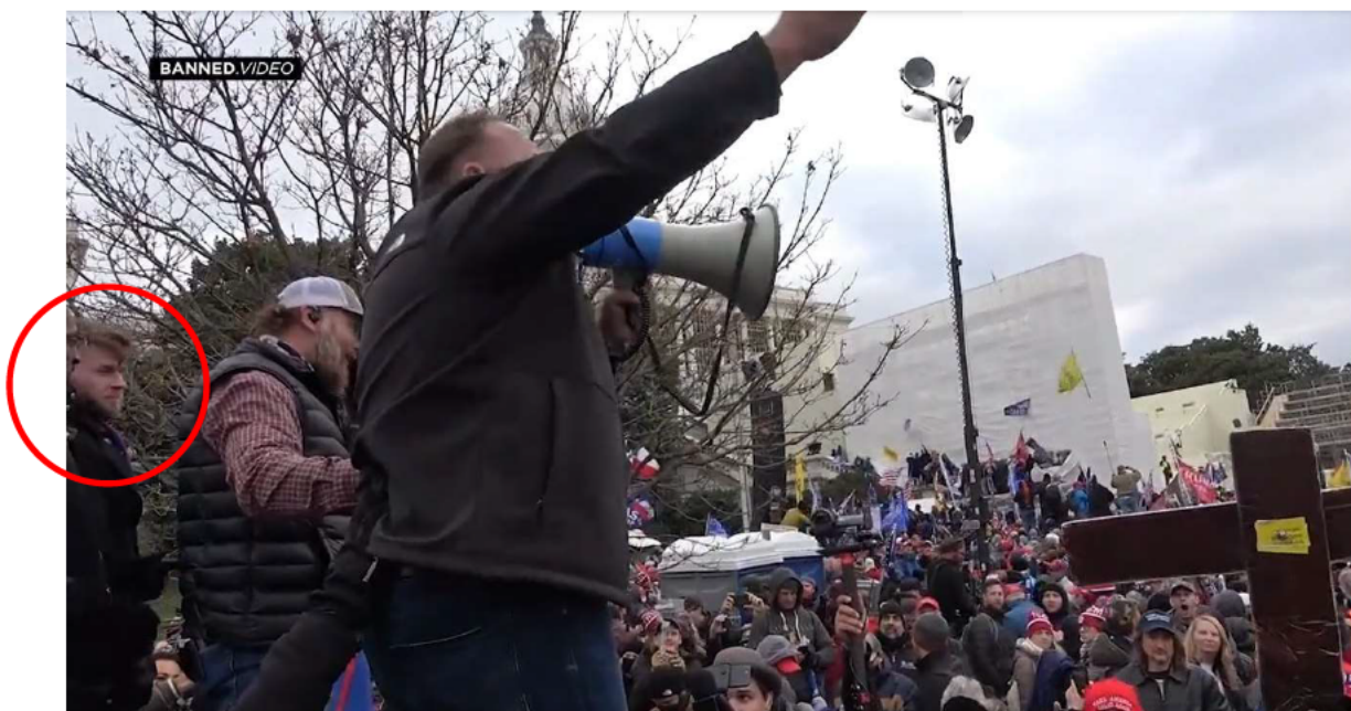
VIDEO: Alex Jones Tried To Stop Storming of DC Capitol